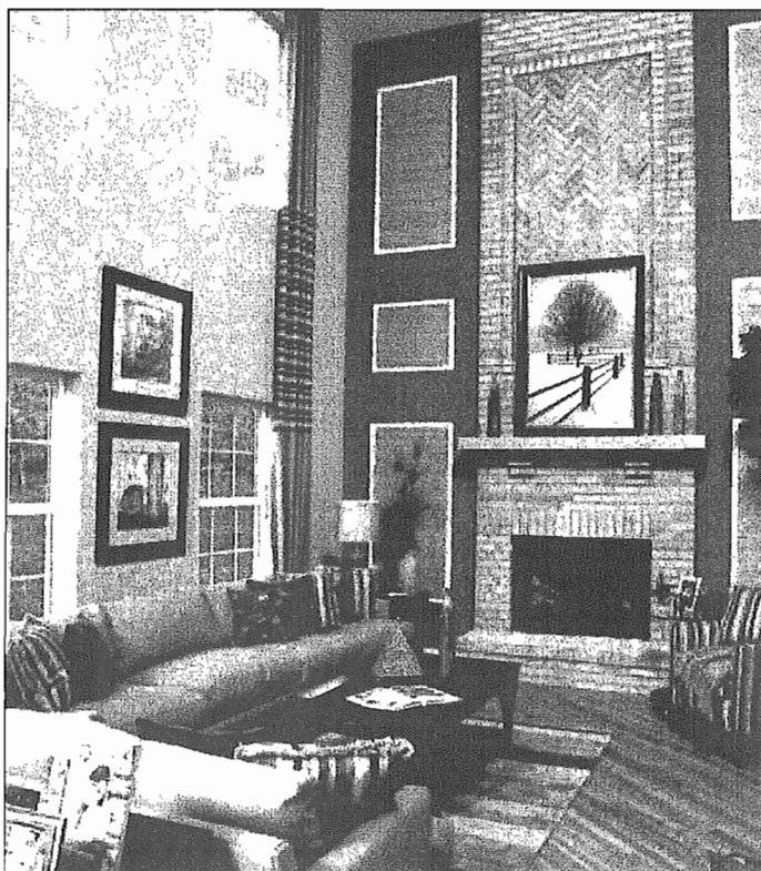
The Fairfield model at Prairie Woods includes wood floors, two-story fireplace and a picture window wall.

To reach Prairie Woods from Rand Road and Rt. 176, go west on Rt. 176 for 1 ½ miles, then north on Darrell for 2 1/2 miles, then left on Dowell for ¾ mile to entrance on the left side. The sales center is open weekdays 10 to 6 p.m., Saturday 10 to 5 p.m. and Sunday 11 to 5 p.m. Call (815) 759-9898.